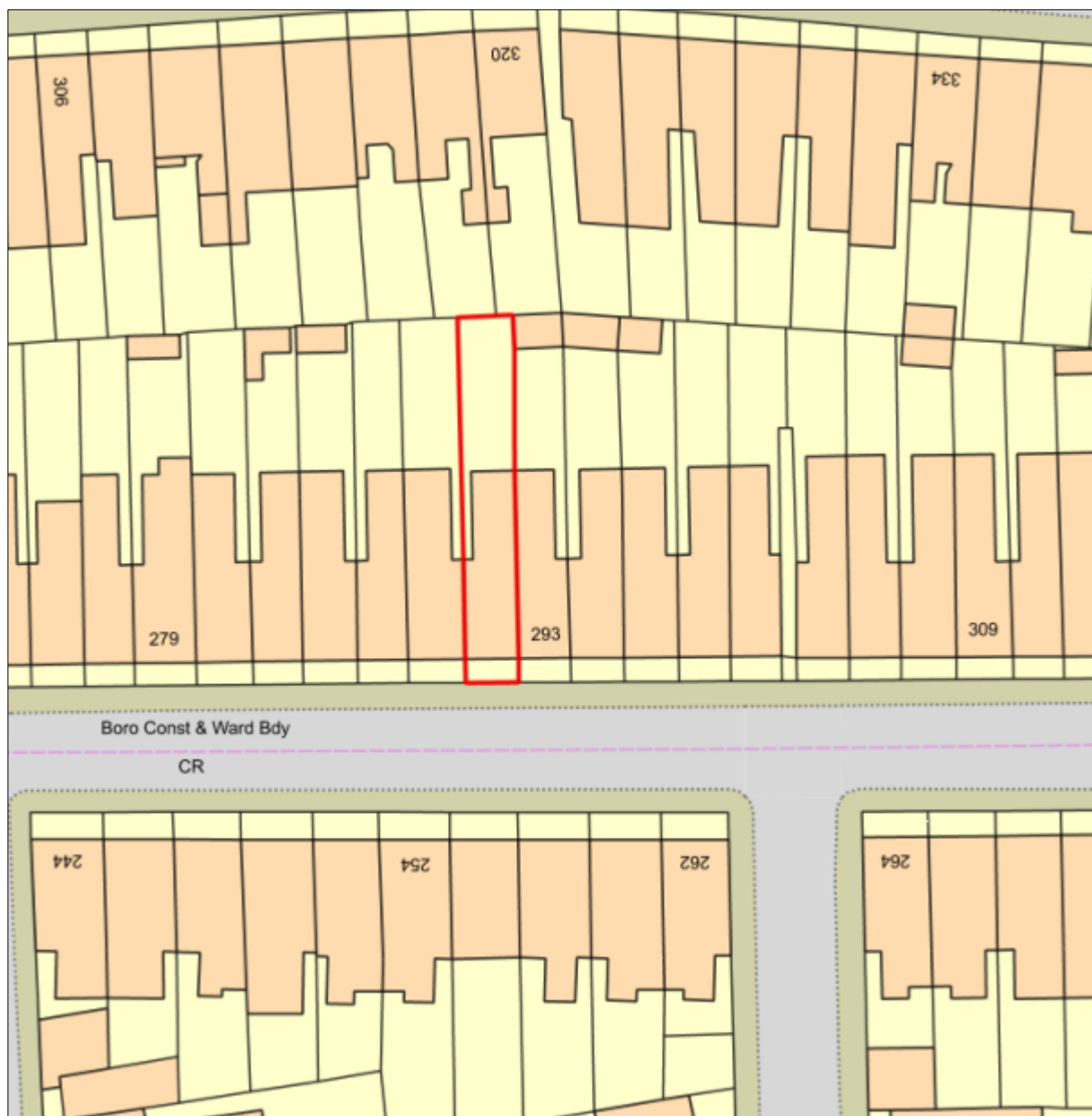
Figure 1 Site Location Plan